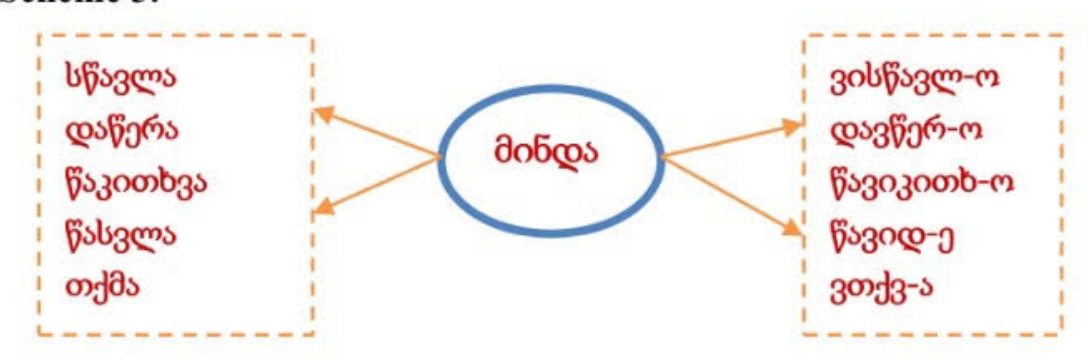
Saginadze R., Kikvadze M., 2018

III. In accordance with the increase of the level of language proficiency – increasing the delivery dose of grammar issues. From this point, we focus on teaching verb forms. We introduce the forms of all three tenses of the verb (present, future, past) (18 in total). We give exercises for writing a verb in the table of different time forms.